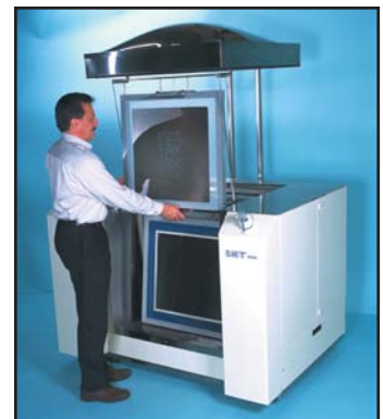
Fig. 3 Visit the Smart Sonic Website for additional information and photos on the Model 6000 and other stencil cleaning products: www.smartsonic.com

Specifications are subject to change without notice. For additional information or photos, visit the Smart Sonic Website.